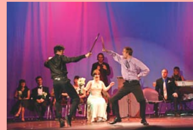
Wedding swordfight!