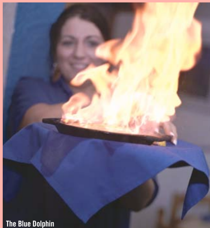
The Blue Dolphin

Ave.) is located inside the lobby of the landmark Grand Theatre in downtown Grand Haven. Between the underwater aphrodisiacs on special, the relaxed lighting, 120-gallon saltwater aquarium, intimate seating area and music every night, you'll be hard pressed to find a more appropriate romantic interlude manifesting elsewhere. Sushi-wise, Futomaki (Crab, prawn, cucumber, avocado, sesame seeds), Seared Scallops (Sesame scallops, shitake, cucumber, soy glaze) and Tidal Wave (Smoked salmon, cream cheese, green bean) are excellent, and the fresh fish menu offers a Sam Adams battered Fish-n-Chips or BBQ Wild Salmon. My suggestion for avoiding chaos that may derail romance would be to avoid Mondays — open mic night — unless you are two vaudevillian slam poets or a Carpenters cover band looking to publicly proclaim your love for each other. ■